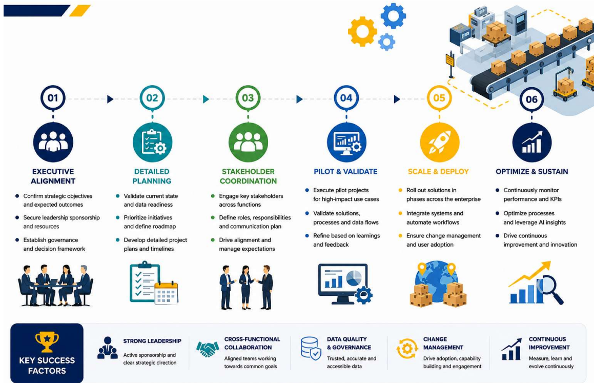
Modernization Transition Roadmap

Successful modernization will require executive alignment, phased implementation planning, stakeholder coordination, and long-term organizational change management.