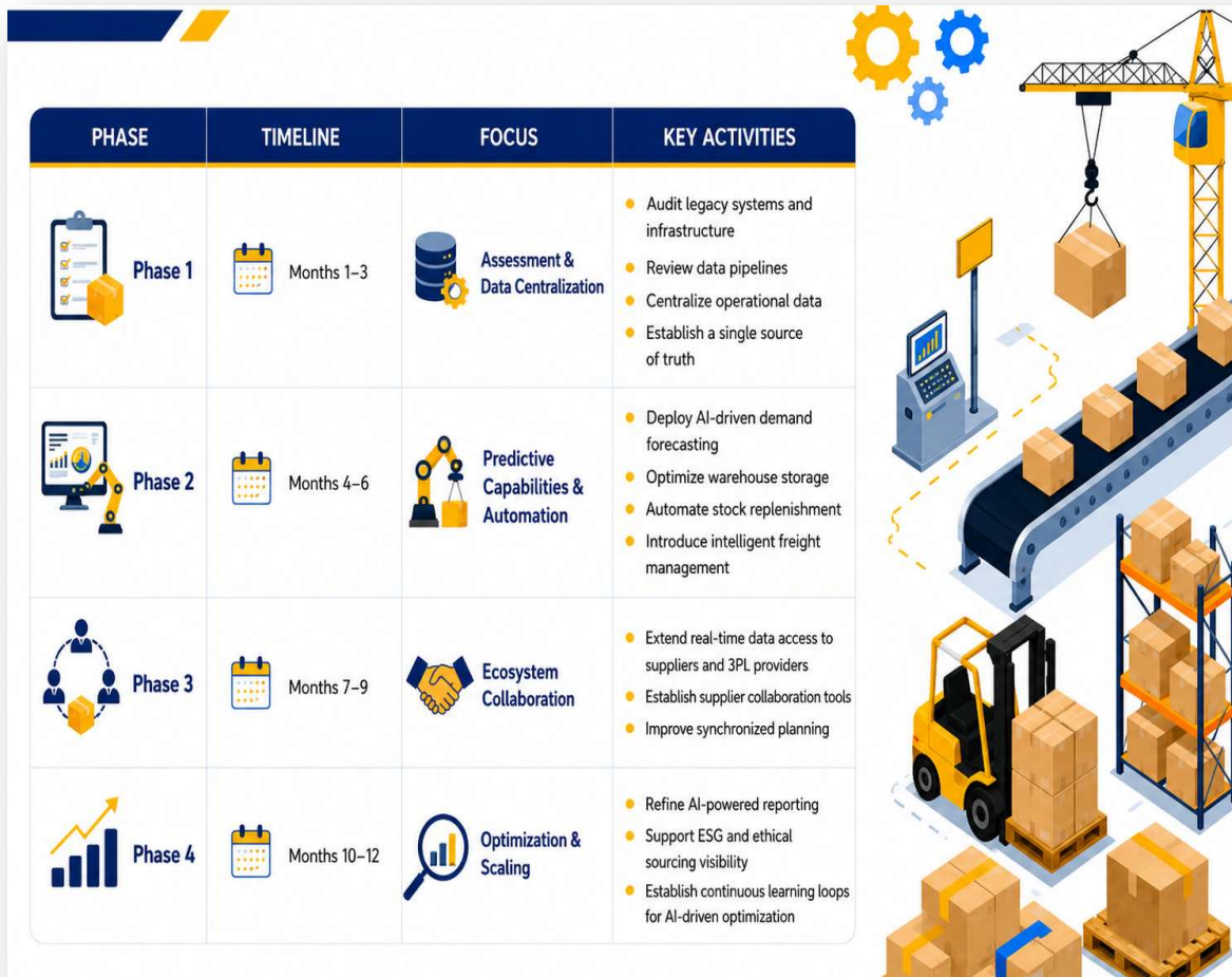
Supply Chain Modernization Roadmap

The roadmap is structured to progressively transition the organization from fragmented supply chain operations to a centralized, data-driven, and intelligent operational ecosystem capable of supporting long-term efficiency, resilience, and operational growth.